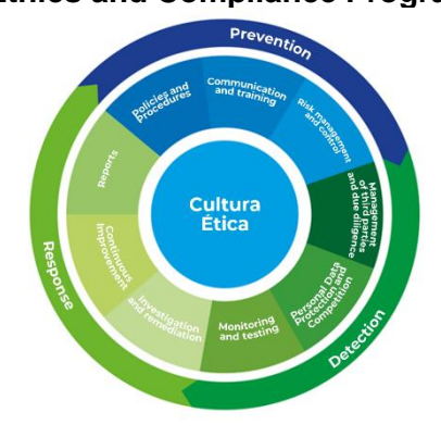
Ethics and Compliance Program

The central element of GEB's Compliance Program is the culture of ethics. Managers and all employees must take ownership, represent and live by the Business Group's corporate values in their daily interactions with stakeholders. The example and visible conduct of its managers consistently reinforces the possibility of aligning behaviors of integrity with the